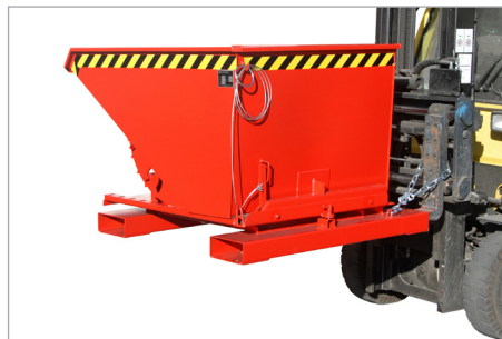
3S, ready to empty to the right