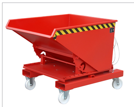
S3S with castors