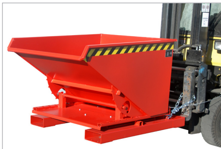
3S, ready to empty forwards