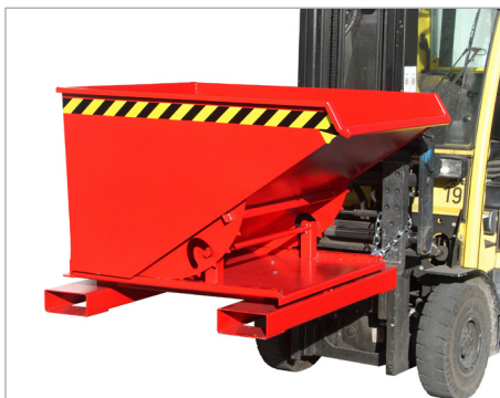
3S, ready to empty to the left